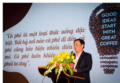
Minister of Agriculture and Rural Development Le Minh Hoan giving the speech at the workshop.

On the afternoon of February 14, 2023, the Ministry of Agriculture and Rural Development in collaboration with IDH Sustainable Trade Initiative, JDE Peet's Company and members of the PPP Task Force on Coffee held a workshop on reducing greenhouse gas emission in the material area of Vietnamese coffee. At the workshop, the Ministry of Agriculture and Rural Development (Department of Crop Production), IDH and the Global Coffee Platform (GCP) signed a Memorandum of Understanding on cooperation on low-emission coffee production, meeting standards for coffee production, export and domestic consumption. At the same time, these organizations will cooperate with major coffee companies to build and implement 03 low-emission coffee production projects in the 2021-2025 period, with the vision to the year 2030. The three coffee production projects will be co-implemented from 2022-2025 by JDE Peet's, IDH, ACOM, LDC Viet Nam, Simexco, GCP, Syngenta and farmers in 4 provinces of Lam Dong, Dak Lak, Dak Nong and Gia Lai, with the total investment of 3.6 million Euro. More than 48,000 farmers are expected to practice sustainable production practices and improve incomes.