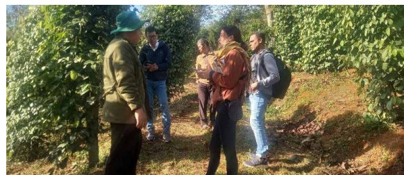
Carry out survey, assessment and information collection on pepper in provinces.

The Plant Protection Department in collaboration with Viet Nam CropLife Association and members of the PPP Task Force on Agro-Chemicals held a press conference to announce "Standards on field testing of pesticides to prevent and control harmful organisms by unmanned aerial vehicle (UAV)". This basic standard can be considered as the first document guiding the registration and deployment of the application of unmanned aerial vehicles (UAV of Drone) in the field of agriculture and plant protection. This is also the official legal basis for the registration of pesticide products Drones/UAVs to use and at the same time creates a premise for the expansion and widespread application of new spraying technologies in Viet Nam to improve the level of efficiency, safety for users and the quality of agriculture products. The potential for application of drone technology to spray pesticides to prevent pests is huge, especially on crops such as rice, maize, and fruit trees with the same or higher control level than conventional spraying. Besides, the Drone/