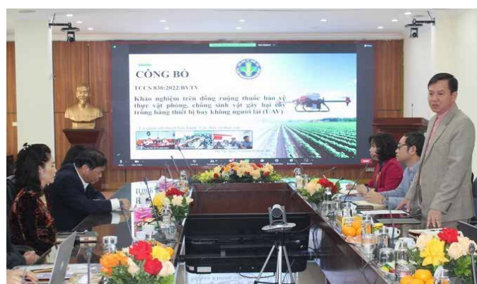
The announcement of "Standards on field testing of pesticides to prevent and control harmful organisms by unmanned aerial vehicle (UAV)"

UAV technology also helps to save significant amount of drug water and labor. Farmers participating in the trial also reported that they were less exposed to pesticides than conventional spraying.