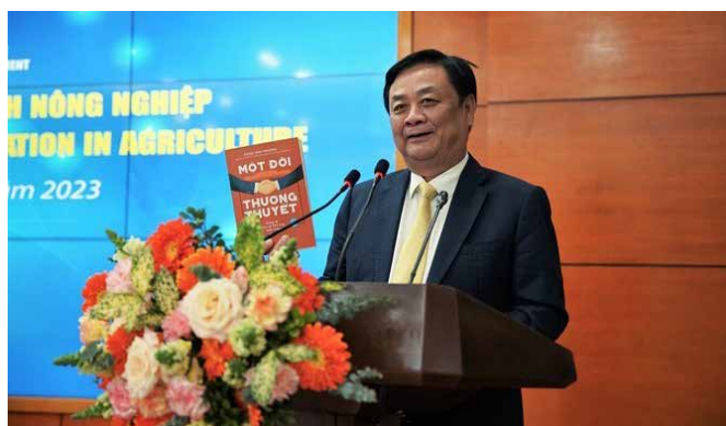
Minister Le Minh Hoang giving the speech at the Conference

On February 10, 2023, the Ministry of Agriculture and Rural Development held a Conference on International Cooperation in Agriculture to share and discuss past results in order to enhance the effectiveness of international cooperation and international economic integration in the upcoming time.