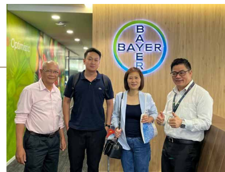
PSAV Secretariat working with Bayer

On the morning of February 14, 2023, the Secretariat of Partnership for Sustainable Agriculture in Viet Nam (PSAV) had a direct meeting with Bayer Viet Nam - Co-Head of the private sector of PPP Task Force on Rice to discuss and re-evaluate the Task Force's performance in the first three months of 2023 and review plans for the year. After completion, the draft plan will be sent by Bayer in collaboration with the National Agricultural Extension Center (Co-Head) to relevant units and members of the Task Force for comments and implementation.