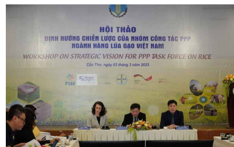
Thực hiện khảo sát, đánh giá, thu thập thông tin vụ mùa Hồ tiêu các tỉnh.