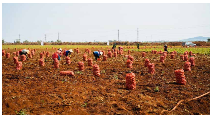
Farmers harvesting potatoes

In the period between 2022-2025, the factors in the linkage chain will continue to implement and expand the project to develop a model potato farm in some Central Highlands provinces such as Lam Dong, Dak Lak and Gia Lai. The project aims to expand production scale to over 2,000 hectares with more than 1,000 farmers participating, aiming towards helping farmers increase the yield and quality of potatoes, bring about real profit after cultivation and adapting to climate change, contributing to environmental protection in agriculture.