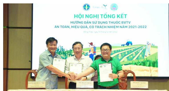
The signing of cooperation agreement 2022-2023 in Dong Thap between the Department of Plant Protection, Dong Thap Department of Agriculture and Rural Development and CropLife Viet Nam