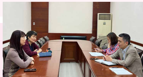
Discussing and working with Cargill on the plan of cooperation and development of the livestock industry within the framework of the PPP Task Force on Livestock

Within the framework of the Partnership for Sustainable Agriculture Development in Viet Nam (PSAV), the PSAV Secretariat has promoted the connection of partners, calling for participation of leading livestock enterprises and corporations to promote cooperation activities and sustainable development of the livestock industry in the context of priority topics such as low carbon emission, circular economy of the Ministry of Agriculture and Rural Development in the coming years.