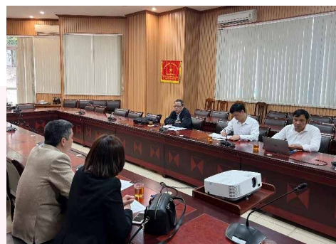
PSAV Secretariat works with livestock industry experts

In the first Quarter of 2023, the Department of Livestock Production - Co-Head of the PPP Task Force on Livestock worked with the Danish Embassy; PSAV and a group of experts plan to do a rapid assessment of the chain's factors in various types of cooperation: FDI enterprises, enterprises with domestic investment in chains, independent private farms, cooperatives, households, the relationship between "public" and "private" in the field of pig as a basis to propose with the Ministry of Agriculture and Rural Development to establish the PPP subgroup on pig production. It is expected to be implemented in the last end of March 2023 and complete the report in May 2023.