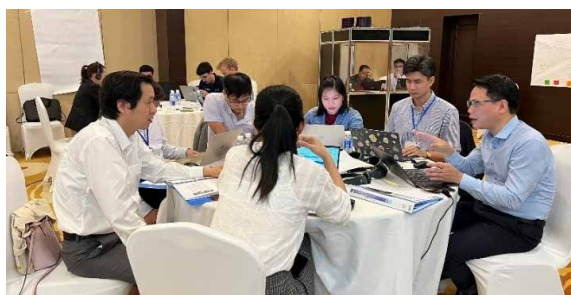
Photo: Deputy Minister Tran Thanh Nam speaks at the bridge point of the Ministry of Agriculture and Rural Development

In 03 days from March 29 to 31, 2023, the Information Center for Agriculture and Rural Development - Institute of Agriculture Policies and Strategy (AGROINFO/IPSARD) organized a proficiency training session on responsible investment in the field of food, agriculture and forestry for partners. At the course, participants received a lot of information and practical lessons on promoting investment in food, agriculture and forestry in the ASEAN region, contribute to regional economic development, food security and nutrition, food safety and equity, as well as sustainable use of natural resources. In addition, trainees will be involved in a network of specialized agencies at the central and local levels, a network of national and international experts throughout the assessment process, identify policy gaps and develop a national action plan to promote and apply the implementation of ASEAN RAI in Viet Nam.