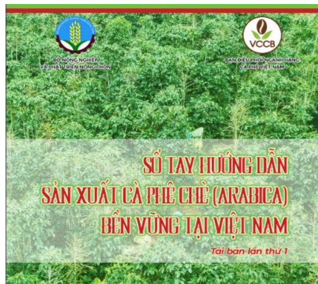
Handbook on sustainable Arabica coffee production in Vietnam

sustainable coffee and tea production, for example: land cover management, pest and disease management, prune branches and create canopy. These updated documents are also the first records since NSC Arabica was built to provide complete and detailed instruction on occupational safety and hygiene.