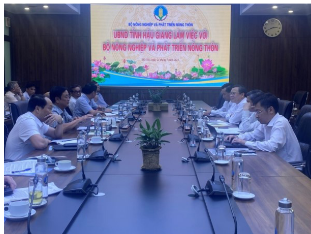
Panoramic view of the session

Minister Le Minh Hoan affirmed: The upcoming Vietnam Rice Festival is an opportunity to evaluate Vietnamese rice. Rice production according to commodity and chains and associated with green growth. The Minister pointed out many highly effective rice growing models such as shrimp-rice, rice-duck models. The Festival will orient farmers so they can access new thinking about rice production and the most optimal technologies to enhance the value of the industry. This is also an opportunity for institutes and schools to display the latest achievements in rice seed technology.