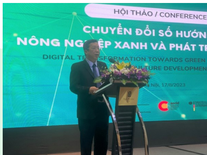
Deputy Minister Hoang Trung spoke at the conference

Vietnam's agricultural and rural development strategy also emphasizes innovation and taking advantage of the achievements of the Fourth Industrial Revolution to move towards ecological agriculture and modern rural areas. Although the potential of agricultural digitalization is huge, Vietnam still faces many challenges such as poor digital infrastructures, limited scale of digital application, and lack of highly specialized human resources. UNDP and the Ministry of Agriculture and Rural Development have collaborated to build an electronic traceability system to track greenhouse gas emissions in dragon fruit and shrimp production. In the future, this system could be expanded to manage carbon footprints for other export industries. This will help Vietnam's agricultural products comply with international quality standards on