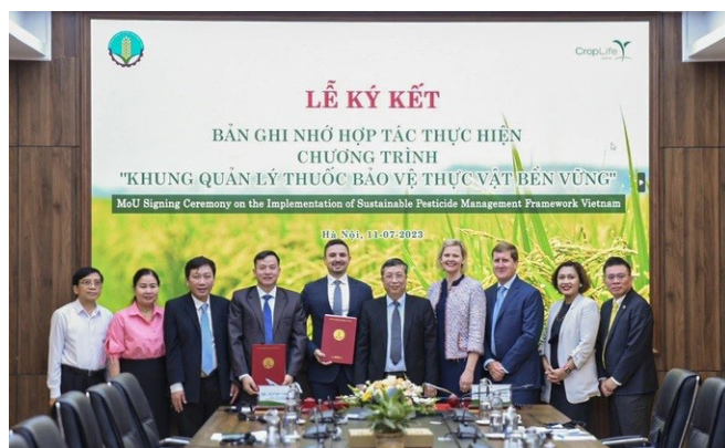
Signing ceremony of the Memorandum of Cooperation to implement the framework program for sustainable pesticide management

On the afternoon of July 11, 2023, the Department of Plant Protection, the Ministry of Agriculture and Rural Development and the Asia CropLife Association signed a Memorandum of Cooperation to implement the Sustainable Pesticide Management Framework Program for the 2023-2028 period (SPMF). The goal of this Program is to protect