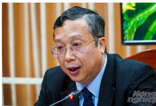
According to Deputy Minister Hoang Trung, rice is one of the crops that emits the most emissions, but also has high potential to reduce emissions if good production solutions and practices are applied.

Speaking the opening speech at the "Multi-stakeholder Workshop on Supporting the PPP Task Force on Rice in Efforts to Reduce Emission" held on the morning of September 14, 2023, Deputy Minister Hoang Trung affirmed, Viet Nam is ready to call for cooperation and support from international organizations in the region and the world in efforts towards building sustainable agriculture, especially rice production in the context where the environment is threatened by climate change and the increase of greenhouse gas. In addition, with the support of the World Economic Forum and the Asian Growth Organization, Viet Nam is implementing the Food Innovation Connection Center with the PPP Task Force on Rice in transforming the industry towards lower emission; mobilizing the private sector to invest in green technology across the entire value chain; achieving a reasonable investment rate for technology and innovation. Making Viet Nam a typical low-emission rice producer in the ASEAN region.