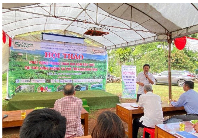
The workshop for waste collection movement in coffee growing areas

On the morning of July 7, 2023, in Dak Ha commune, Dak Glong district, Dak Nong province, the Global Coffee Forum coordinated with the Center for Agricultural Extension and Seeds of Agriculture and Forestry of Dak Nong province to organize a workshop with the participation of representatives of the Department of Agriculture and Rural Development of Dak Nong province, representatives of Dak Ha Commune People's Committee, relevant Departments, mass organizations, coffee companies and more than 140 coffee farming households in the district to discuss issues related to waste collection in agriculture production and launch a campaign to clean up the environment in coffee production areas. This is an activity within the framework of "Collective Action Initiative on Responsible Use of Agricultural Materials in Coffee Production", co-sponsored by Nestle, JDE Peet's, Lavazza Foundation, Tchibo, IDH, Neumann Kaffee Gruppe, Sucden Coffee, Vietnam Coffee Industry Coordinating Board (VCCB) and Vietnam Coffee & Cocoa Association (VICOFA) and are operating in 5 Central Highlands provinces.