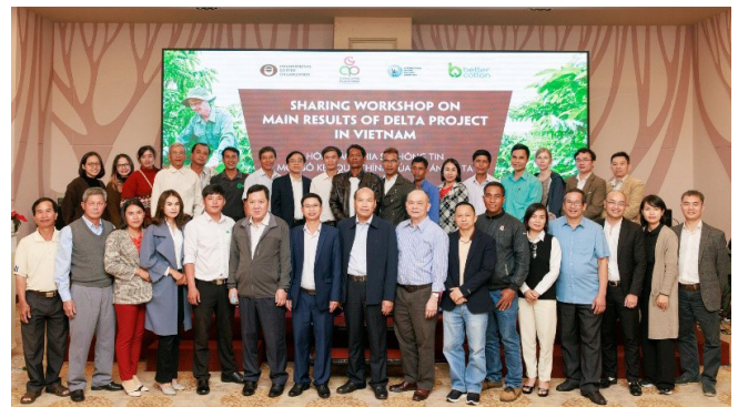
Picture: Workshop on Sharing key results of the Delta project in Vietnam

The workshop received comments and feedback from the