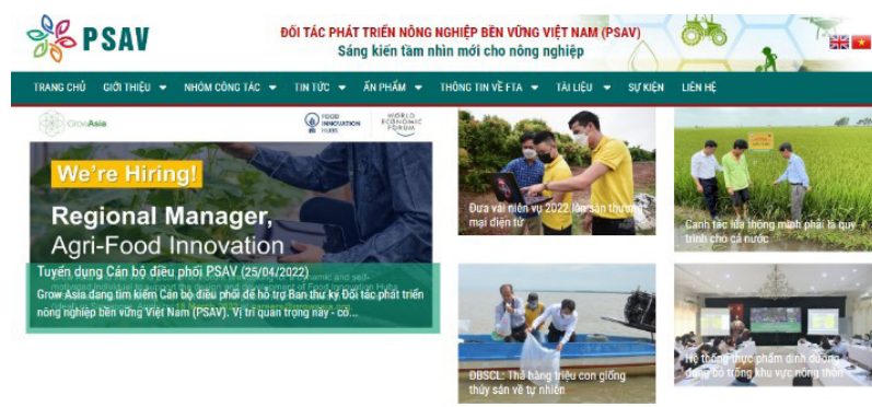
PSAV website after being restructured

In order to support businesses, farmers, localities and related partners with necessary and timely information of the FTAs so that they would be able to take advantage of incentives from those Agreements, thus helping Vietnamese agricultural enterprises to make rapidly decisions, taking advantage of every opportunity, proactively improve production capacity, build product brands, improve product quality, meet the increasing requirements of the market; clearly understand tariff commitments, tax elimination roadmap for specific products and rules of origin of goods; as well as understanding about legal regulations on customs and trade remedies to proactively master new markets.