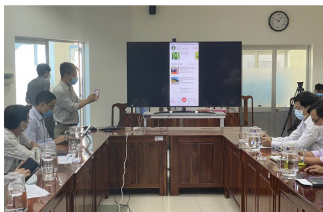
A representative of the Department of Plant Protection introduced and guided how to use the application “Identification of Rice Pest”

The software to identify pests on rice has been coordinated by relevant units in An Giang province from June 2021. The software combines an application to identify pests on the phone using AI (artificial intelligence) technology with an expert system that interacts with users online. The application provides farmers with the function of automatically identifying pests through photos and can look up information about pests, including: images, morphological and biological characteristics, and prevention measures; documents on plant protection, the process of preventing and fighting harmful organisms, information on warnings and recommendations on how to treat the pests.