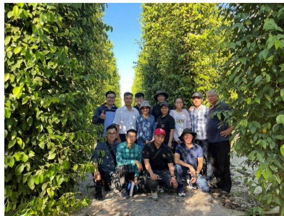
VPA and 16 companies involving in the investigation

This is an annual activity of the Vietnam Pepper Association and the PPP TF on Pepper and Spices to preliminarily assess the productivity, area, output of pepper and other factors affecting production in the key pepper growing provinces of the Southeast and the Central Highlands. Using the methods like meeting, exchanging, interviewing farmers, farmer associations, cooperatives, supply agents, pepper export companies; Actual observation of planting gardens and planting areas in the provinces; The assessment and observations of the survey team have produced the summary assessment for the pepper season 2022 in the mentioned-above provinces. It is expected that the end of March/early April will basically end the survey. From there, the