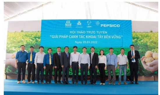
Participant at the Workshop

The workshop attracted the attention of more than 200 farmer households with three virtual stations at: Potato fields of farmers in Chu Prong district (Gia Lai province), Dalat Potato, Vegetable & Flower Research Center (Lam Dong province) and the Central Highlands Agro-Forestry Science and Technology Institute (WASI). The event was aimed to introduce the potato farming model that was tested in Gia Lai and together discuss and offer solutions for sustainable agricultural development from businesses to farmers in the Central Highlands.