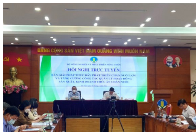
MARD Vice Minister Phùng Đức Tiến chaired the Seminar at the virtual station in Ha Noi

Conclusions of the Seminar, Vice Minister Phung Duc Tien suggested that the units under MARD would closely coordinate with the localities to implement synchronous solutions to continue to develop linkages in animal husbandry, slaughter, processing and domestic consumption of livestock products and export. Accelerate the application of science and technology in production