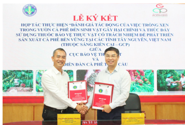
Signing the Memorandum of Understanding between Plant Protection Department and Global Coffee Forum

The Memorandum of Understanding has an implementation period of 18 months (until December 2024), is a component of a series of technical assistance activities under Component II of GCP's CAI Project, focusing on solving the following issues; related to the management and use of agricultural materials, towards sustainable coffee production in Viet Nam such as: investigating, monitoring, managing harmful organisms and using pesticides for intercropped coffee gardens; improve management capacity and prevent harmful organisms for technical staff and coffee farmers; improve inspection capacity for plant protection staff and raise awareness and responsibility for environmental protection for pesticide production and trading establishments in the Central Highlands.