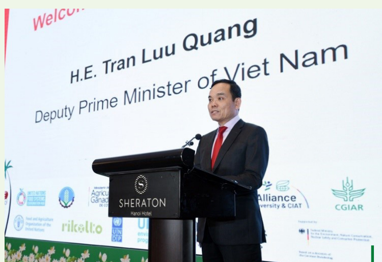
Deputy Prime Minister Tran Luu Quang delivered the opening speech at the conference

The theme of the 4th conference was "Transforming the food system into a healthy, sustainable, and adapting to climate change in the context of the new crisis" with the participation of more than 300 delegates, including nearly 200 international delegates from many countries, United Nations agencies, and international organizations. In terms of senior leadership, the Conference was attended by the Ministers of Switzerland, Malawi, Rwanda, Kenya, Ethiopia, Saint Vincent and the Grenadines; Deputy Minister of Cambodia, Ghana. In addition, the Costa Rican Minister of Agriculture and the FAO Director-General attended online. On the Vietnamese side, the Conference was attended and hosted by Deputy Prime Minister Tran Luu