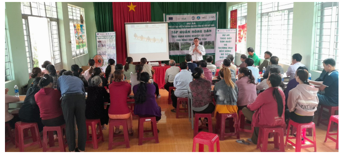
Training on sustainable pepper farming techniques for farmers