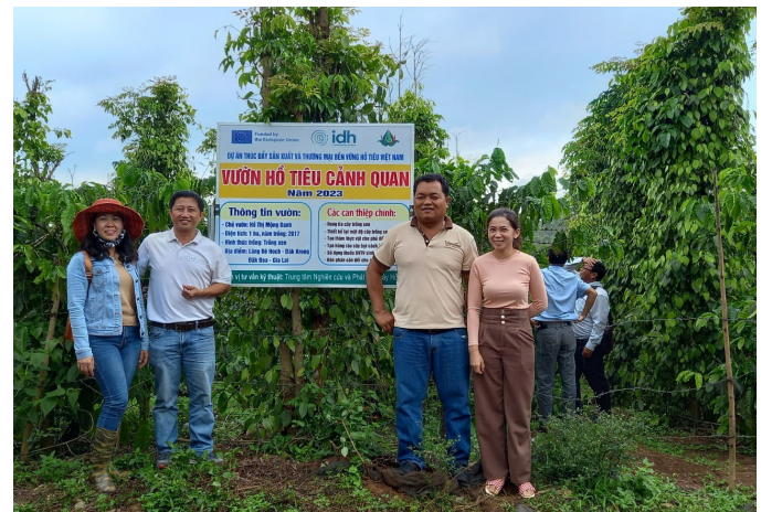
Design and install 2 signs of landscape cluster model

intervention for pepper farmers (through training activities, monitoring and practical guidance in fields, visiting, sharing and learning...), help farmers: control fertilizer, reduce fertilized based on soil analysis and guidance of experts; control pesticides (do not use banned drugs, replace with new drugs, yeast, biological drugs), intercrop, increase shade for pepper towards increasing income; conserving water and soil with effective interventions such as reducing irrigation water by water-saving practices and technologies; support farmers to make their own intervention plans on household gardens.