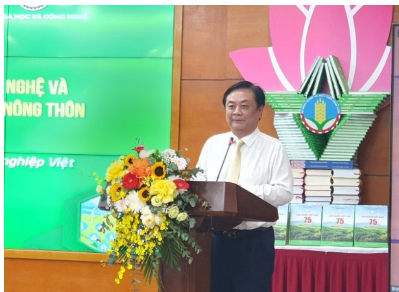
Minister of Agriculture and Rural Development Le Minh Hoan spoke at the Conference

into practice will reach more than 90% by 2025 and more than 95% by 2030. At least 60% of research results are recognized as technical progress and applied to production. The total value of technology transfer and commercialization of research results for enterprises will increase by 20% in the 2021-2025 period and 35% in the 2026-2030 period.