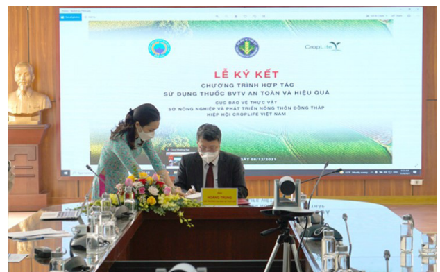
PPD Leader to sign the program on cooperation for effective and safe use of pesticides.

In order to implement sustainable activities, VPA will deploy more activities, focusing on closely coordinating with the agricultural industry, promoting cooperation and association with pepper farmers through farmers' organizations to manage and control the production process from cultivation to harvest, handling, processing, preservation ... according to GAP, GMP so as to have clean pepper without chemical residues that importing countries do not allow.