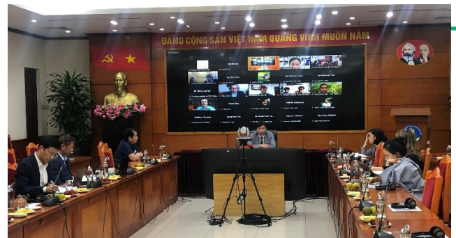
The consultation meeting

On October 29, the Department of International Cooperation (ICD) in coordination with the Secretariat of the Partnership for Sustainable Agriculture Viet Nam (PSAV) to organize a hybrid consultation meeting on the establishment of the Food Innovation Hub in Viet Nam (FIH) offline in Ha Noi and online. The meeting was attended by the Director of the Global Coordinating Secretariat of Food Innovation Centers - the World Economic Forum (WEF), General Director of Nestlé Viet Nam cum PSAV Co-Chair, Program Director of Grow Asia, together with representatives of PPP Task Forces and domestic and international departments, organizations and corporations.