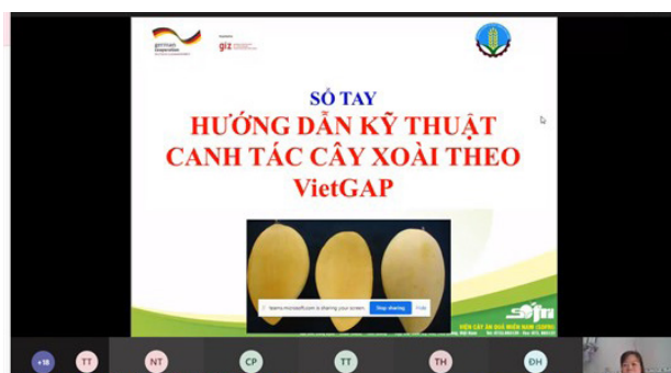
Virtual training on farming techniques for mango in compliant with VietGAP

On October 4-5, 2021, the Department of Crop Production in collaboration with the German Organization for International Cooperation (GIZ) and the Southern Fruit Research Institute (SOFRI) organized an online training course on cultivation techniques for mangoes according to VietGAP standards for 50 agricultural technicians and farmers in Hau Giang and An Giang provinces.