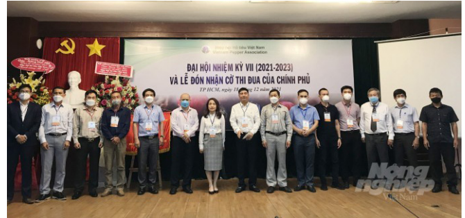
VPA Executive Committee of the VIIth term

meet the needs of domestic and international markets. The Deputy Minister noted that the sector needs to effectively implement a number of approved projects and programs, and emphasized that it is necessary to proactively develop appropriate response scenarios in each phase to ensure that production of brackish water shrimp is not passive in the context of the COVID-19 pandemic.