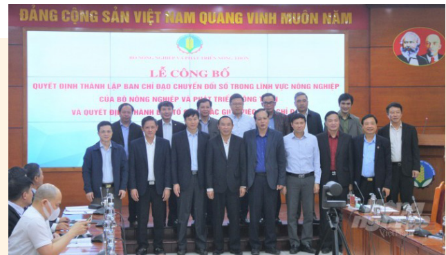
Launching Ceremony of the decision to establish the Steering Committee for Digital Transformation in agricultural sector of the Ministry of Agriculture and Rural Development

- Digital transformation in agriculture aimed at raising awareness of the mission, necessity and urgency of digital transformation in the Agriculture and Rural Development sector and synchronous action at all levels with the participation of all staff, civil servants, officials and employees in the entire Agriculture and Rural Development sector successfully implemented the national digital transformation program.