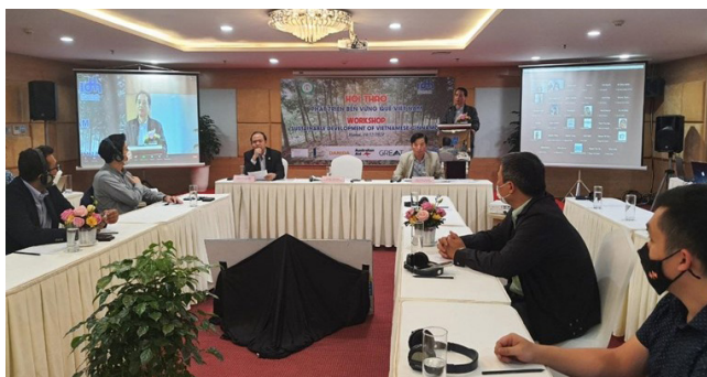
The Workshop on Sustainable Cinnamon Development in Viet Nam

Besides, there is also an increase in activities related to purchasing, processing and exporting cinnamon between domestic and foreign enterprises. Without strategic, timely and sustainable directions for management and development of the cinnamon industry, it will lead to confusion for local management agencies, difficulty in meeting quality barriers, price risk, output market, etc. This can negatively affect cinnamon growers and cinnamon processing and exporting businesses in Vietnam.