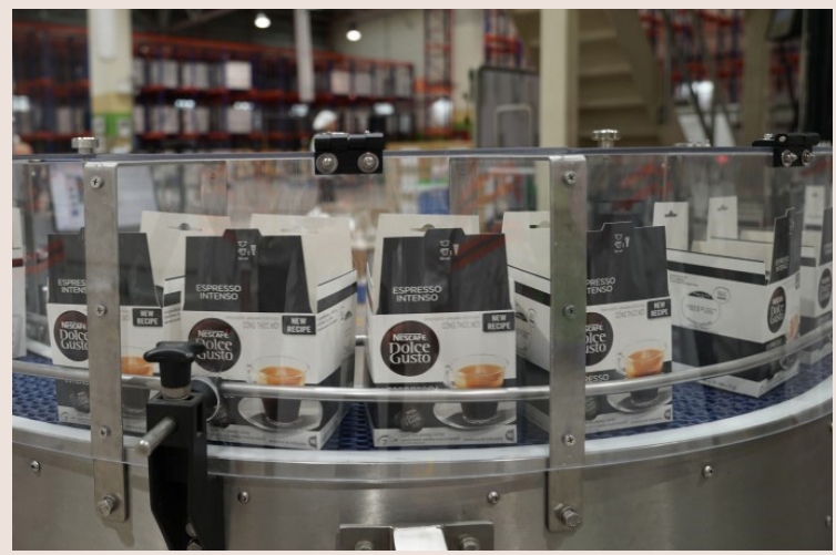
Coffee capsule production line of Nestlé Viet Nam

The PPP Task Forces on rice and fruits and vegetables (F&V) are studying to establish Rice and F&V Coordination Boards to attract producers and traders promote value chain development and information sharing about effective operating models.