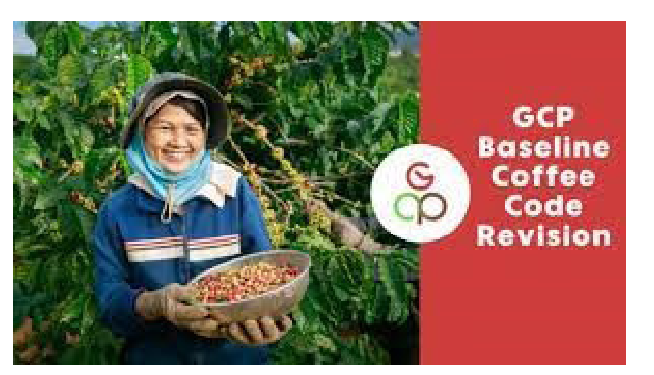
GCP Baseline Coffee Code.

foundation that supports the sustainability, profitability of businesses in producing coffee, ensures farmers' income and well-beings, as well as nature conservation requirements. This is an opportunity for all interested parties to contribute ideas to build and develop a common foundation, and to promote the sustainable development of the coffee sector.