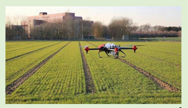
Drones (UAV) in agriculture production (pesticide application) is rapidly growing in popularity in Asia, for its outstanding advantages in efficiency, spray precision, and labor-savings.

- High-level policy overview of India and China on how their governments integrate and enable drone in agriculture;