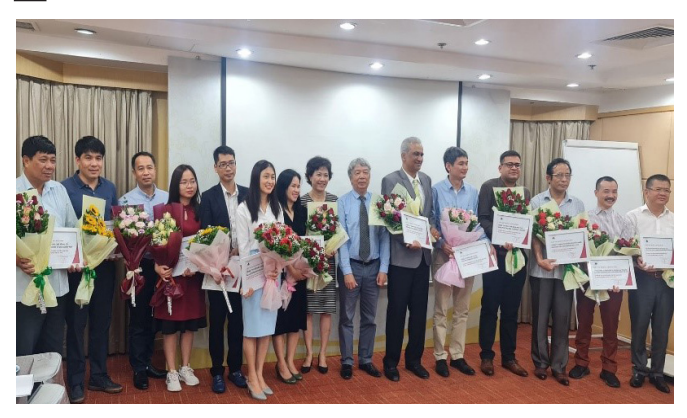
Ceremony to honor top Vietnamese producers and exporters in 2020.

In the morning of April 2, 2021, the Viet Nam Tea Association (VITAS) in collaboration with PSAV and Grow Asia co-organized a PPP Workshop to Promote Responsible Investment and Production in the Tea Sector. Attending the event were representatives from 20 top tea producing companies in Viet Nam, representatives from MARD including the Plant Protection Department (PPD), Agro Processing and Market Authority (AgroTrade), Northern Mountainous Agriculture and Forestry Science Institute (NOMAFSI), and NGOs.