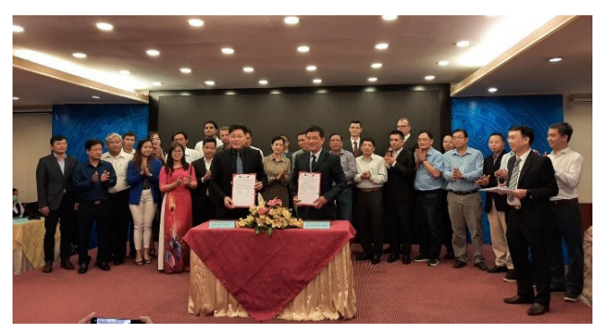
NAEC leader signed cooperation agreement with businesses

On January 29, 2021, in Ho Chi Minh City, the National Agricultural Extension Center (NAEC) hosted the Workshop 'Strengthening public-private cooperation in agricultural extension'. Attending the event were leaders of the Department of Crop Production, PPD, ICD, leaders of Agricultural Extension Centers of provinces in the Mekong Delta and Southeast regions, as well as and representatives of Syngenta, Binh Dien Fertilizer and Nedspice Processing Viet Nam, Bo De Bac Lieu Seafood Group, Loc Troi Group, and press agencies.