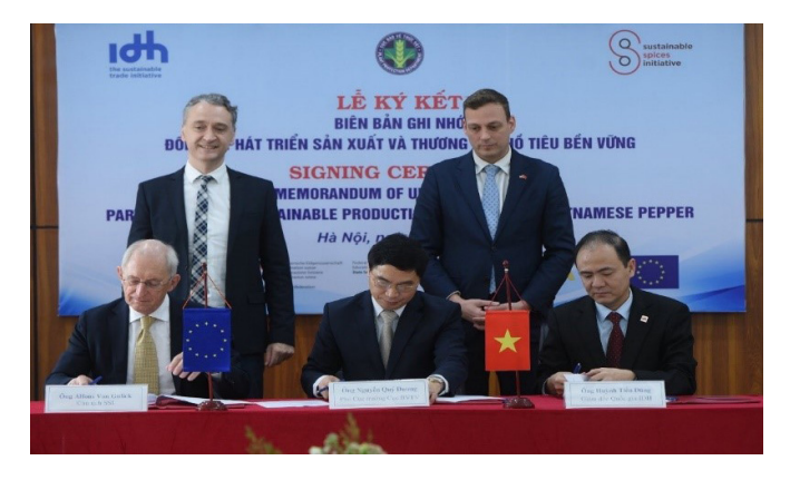
Memorandum of Understanding signed on 31/3/2021 (From left to right (front line) are representatives of SSI, PPD and IDH)

In accordance with the MOU, all the parties involved showed commitment to cooperate and coordinate in the implementation of the plan to promote sustainable