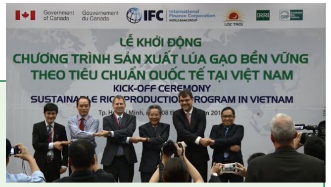
Sustainable rice production program in alignment with SRP standards in Viet Nam

The event attracted more than 300 participants, 50 speakers from 170 organizations, 30 countries, who are members of the SRP, representatives of governments, research institutes, representatives of the private sector and civil society, as well as service providers, development partners and financial institutions. The World Business Council